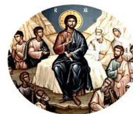
The Eight Beatitudes

On Caritas Sunday we collected over £430.00. Thank you for your generous support. Thank you for the Special Collection for Leprosy, a Charity who fundraise for the cares of those suffering from Leprosy and related diseases in India. We collected £332.05 In February 2026 we will have a special collection, the White Flower Collection which support the Society for the Protection of the Unborn Child (SPUC)